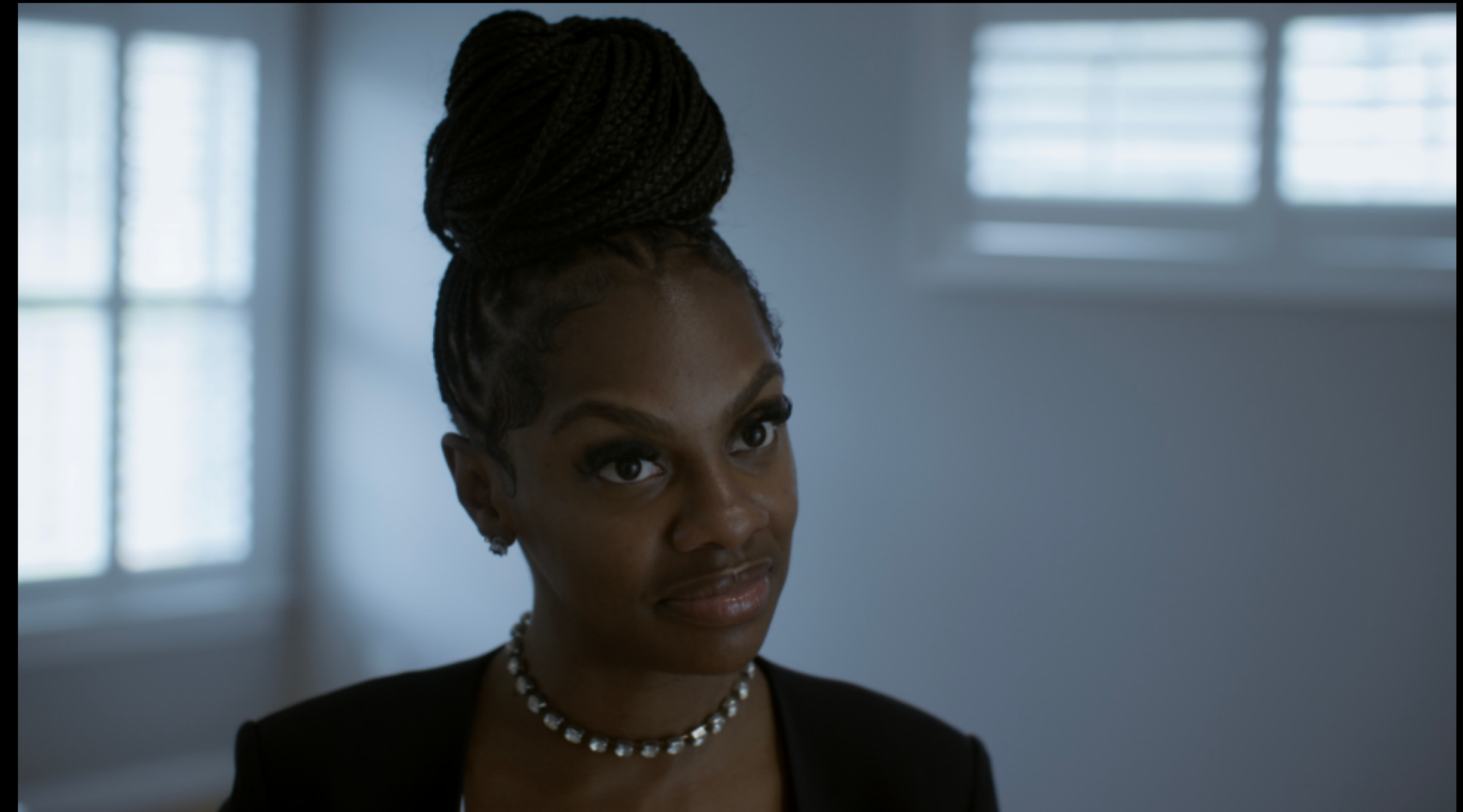
JESS HILARIOUS // DEANNA

2 MINUTES OF FAME, I GOT THE HOOK UP 2, REL