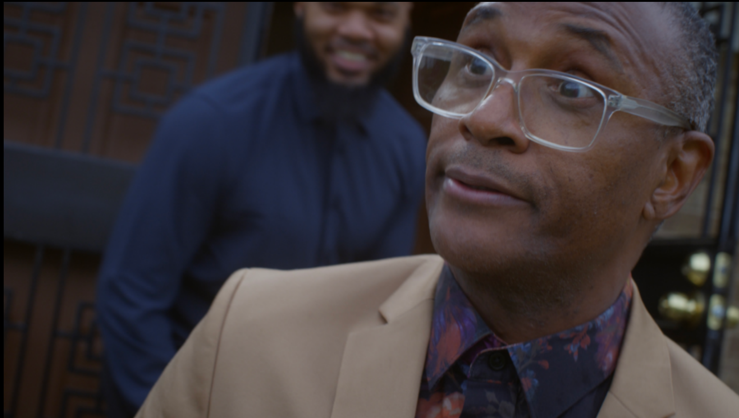
TOMMY DAVIDSON // BRUCE KEVIN

IN LIVING COLOR, BLACK DYNAMITE, BOOTY CALL