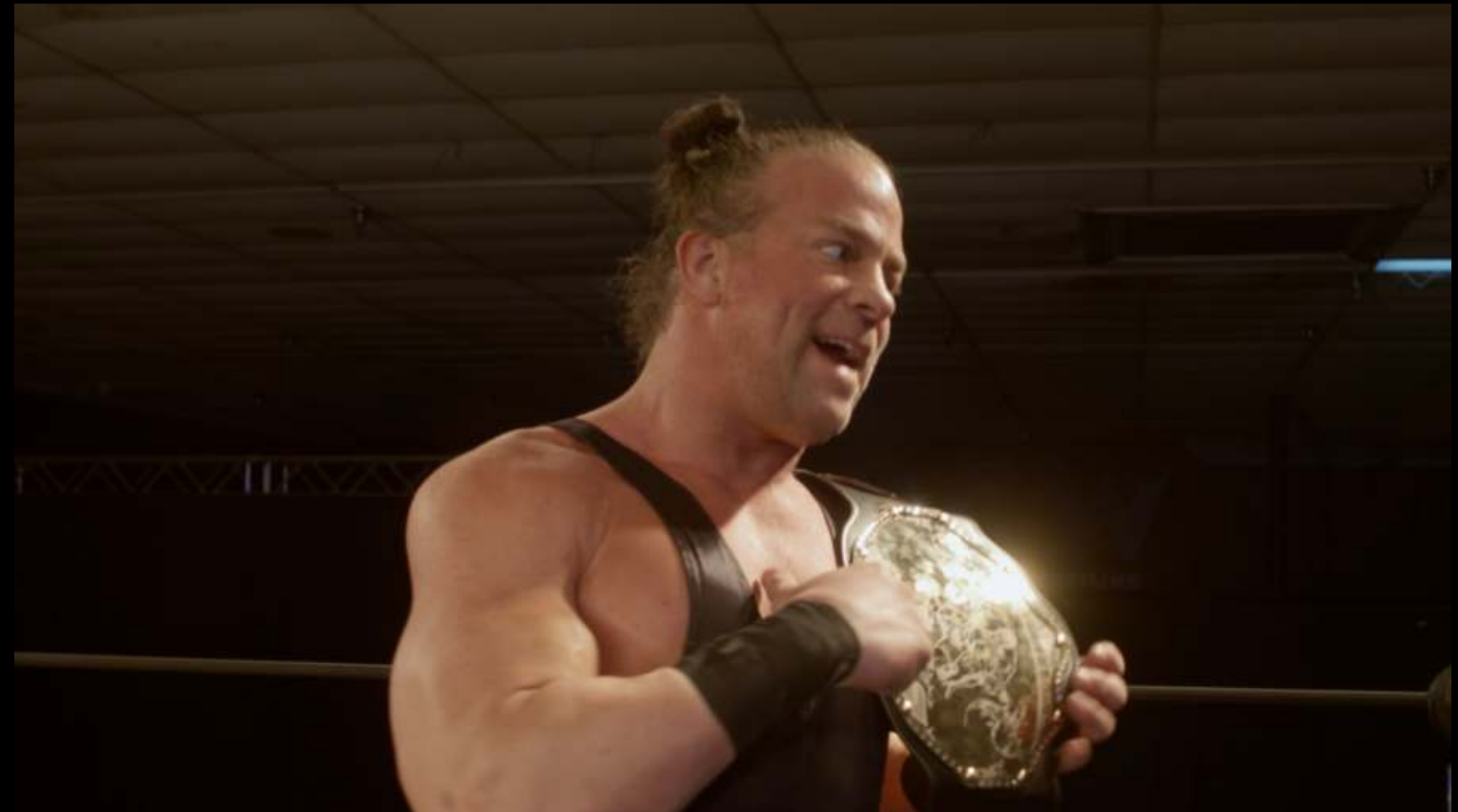
ROB VAN DAM // THE DOMINATOR

IN LIVING COLOR, BLACK DYNAMITE, BOOTY CALL